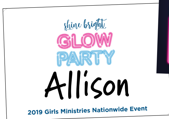
Event Name Tag