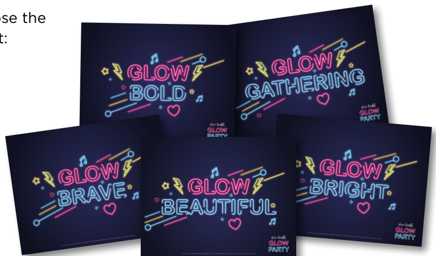
Event Station Signs

Capturing memories is an important part of this event. The Shine Bright Tote Bag will hold special projects and memories.